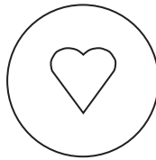
Figure 1. A graphic of the embodied soul. The heart represents the soul, the circle represents the body.

The resulting principle is critical: we can spiritually grow even when the body is weakened. More specifically, we can spiritually grow even when the brain is weakened or just different. Depression, bipolar disorder, and attention deficit/hyperactivity disorder (ADHD) cannot make us sin. Instead, they can be occasions for more obvious spiritual growth. This principle brings psychiatric problems back into Scripture’s domain.